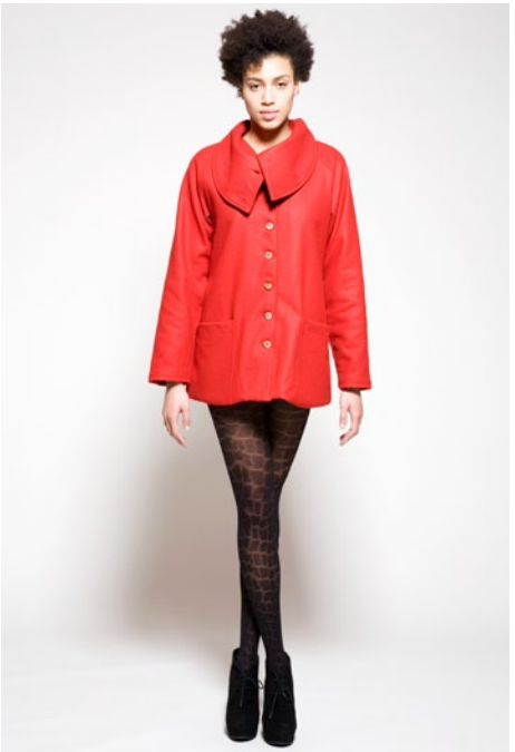
Virginia Woolf Coat