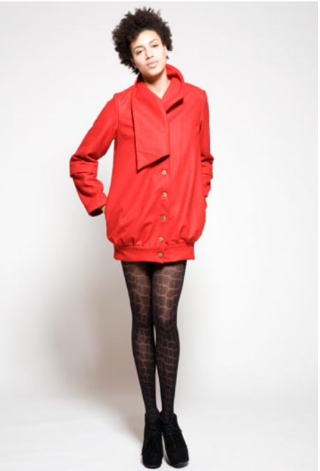
Georgia O'Keeffe Coat