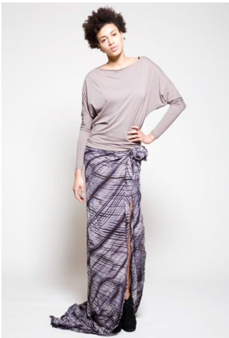
Kimono Sleeve Essential