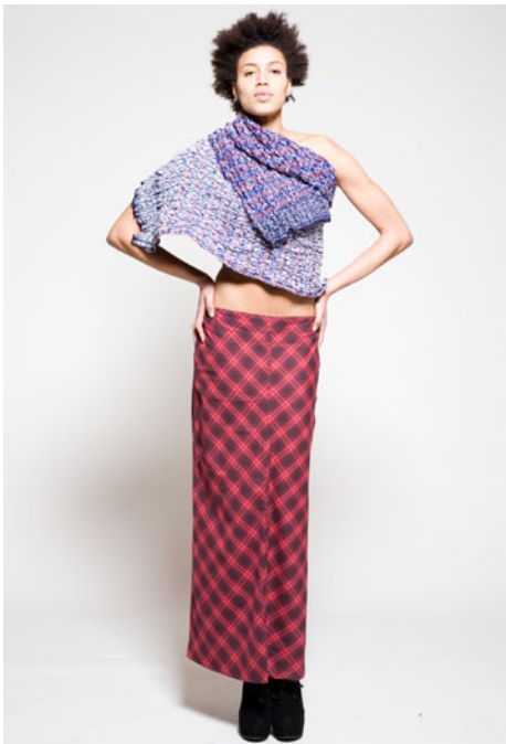
plaid or tweed