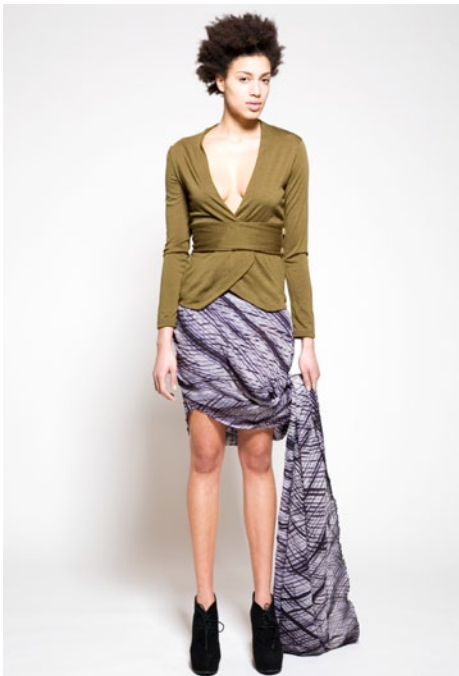
Ella Fitzgerald Cardigan