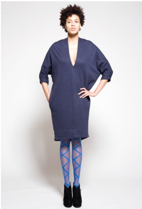
Gertrude Stein Tunic