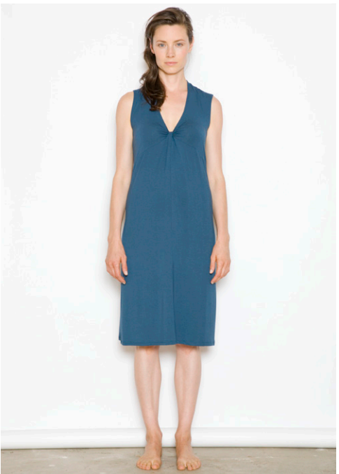
Let The Sunshine In Dress