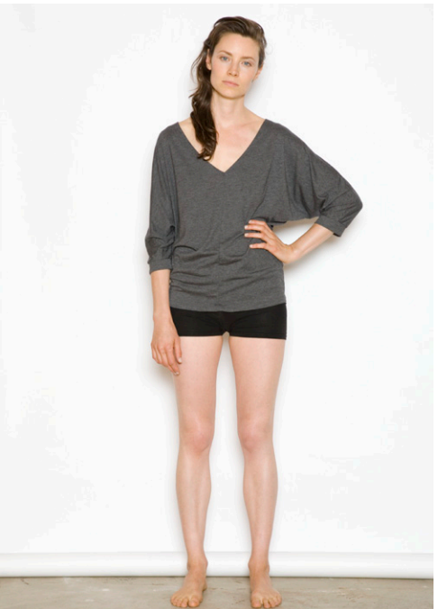
V-Neck Kimono Sleeve Essential