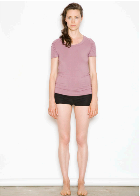
Gathered Raglan TeeEssential