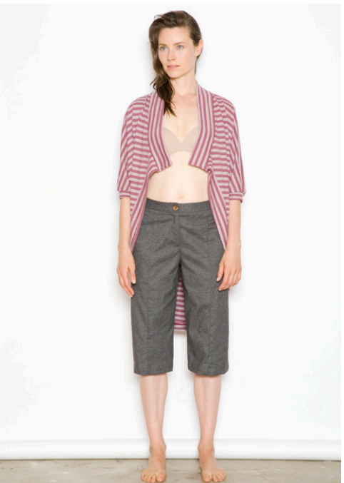
Simmer Down Shrug