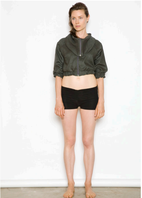
Breathe New Life Bomber