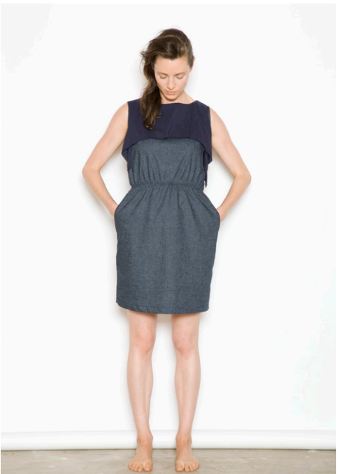
Seven Year Itch Dress