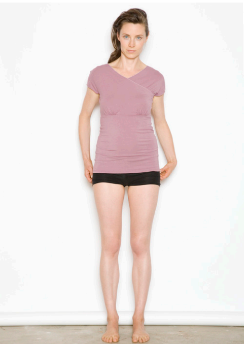
Spice It Up Surplice