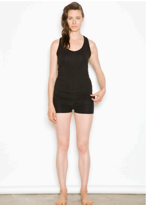
Couture Racerback Essential