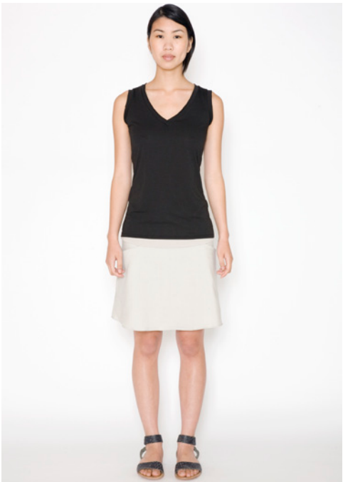
bamboo featherweight / hempcell