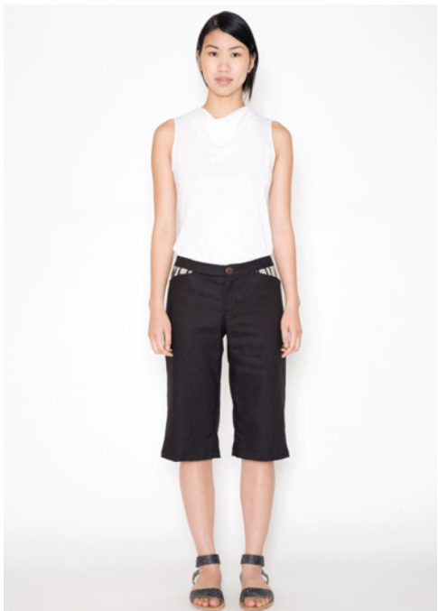
Traverse Trousers Crop